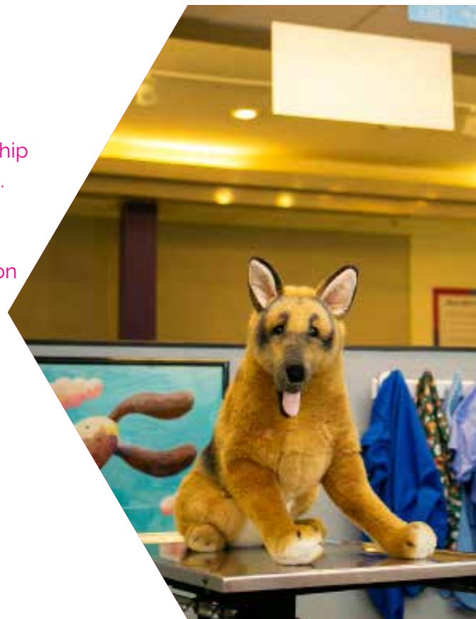
Exhibit Sponsorship ($2,500 - $10,000 annually)

We know that a parent or caregiver is a child's first teacher , and so each exhibit is designed to help parents, grandparents, and guardians maximize learning experiences through natural play.